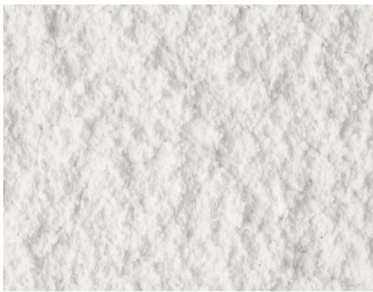
Surface structure: Rough

The Alpha is available in the following surface structures. Please observe that the photos are taken in ca 2X enlargement, and that they also have a slightly grey shade. In the original photos they are completely white.