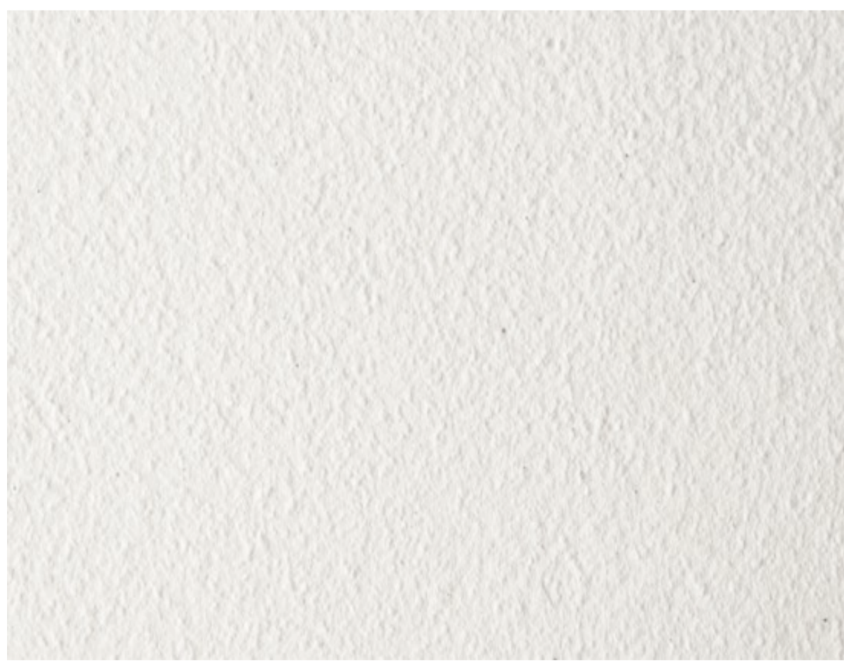
Surface structure: Smooth